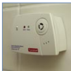
Carbon Monoxide Detector